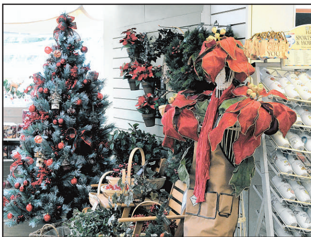
Branching out: Get inspired for the festive season with a wonderful range of Christmas trees and decorations in store.