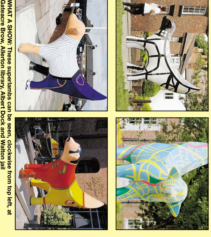
WHAT A SHOW: These superlambs can be seen, clockwise from top left, at Gateacre Brow, Allerton library, Albert Dock and Walton jail