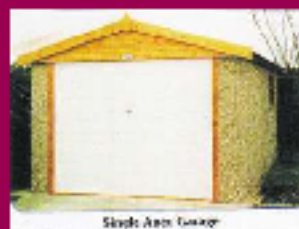
Single Apex Shed