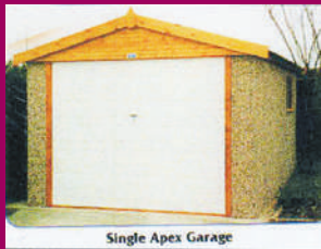
Single Apex Garage