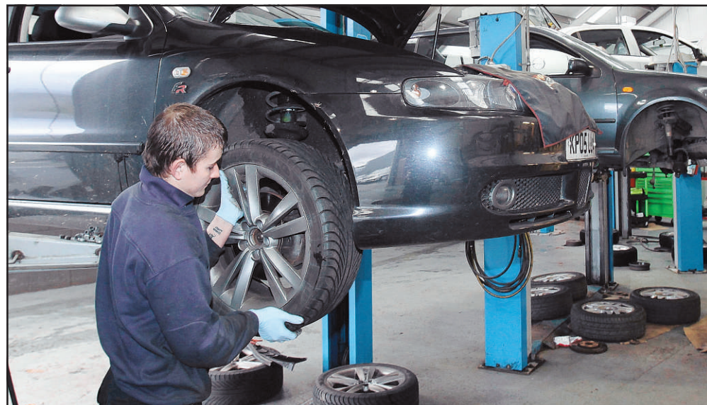
■ TYRES: Get your tyres checked ready for winter

Then why not think about giving the business to your local independent garage as opposed to taking it in to a large main dealer. These days your local garage is well equipped to tackle all kinds of work on all kinds of vehicles, from a full service to an MOT or bodywork repair. As well as the vehicle expertise, your local garage will also give you personal service, attention to detail and good customer care. After all, if you become a regular customer, you also become a valued customer. Today small independent local garages can offer an equivalent service to the big main car dealers. Often they offer a courtesy car service, provided this is booked in advance, and will also carry out a valet after work is complete, deal with vehicle air conditioning problems and even get new car keys issued. New European legislation, which has recently come into force, now offers the motorist greater choice in the after sales, repair and servicing market. The new regulations are called Block Exemption and give car owners a greater option. As long as local garages use genuine manufacturers' parts and follow industry guidelines, they are free to service and repair. Motorists often find that going to a local garage saves them money on their servicing,