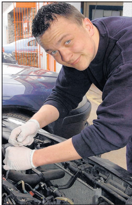
■ GARAGE: Trust your local garage to keep you on the road