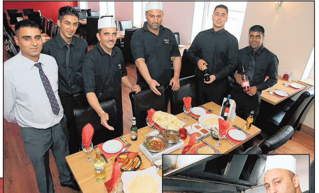
Pictured (below) is the newly refurbished Sanam's Restaurant and (above) the Sanam's team waiting to welcome you

One delighted diner said: "Fantastic food and wonderful service from very friendly and helpful staff. Sanam's is our weekly treat."