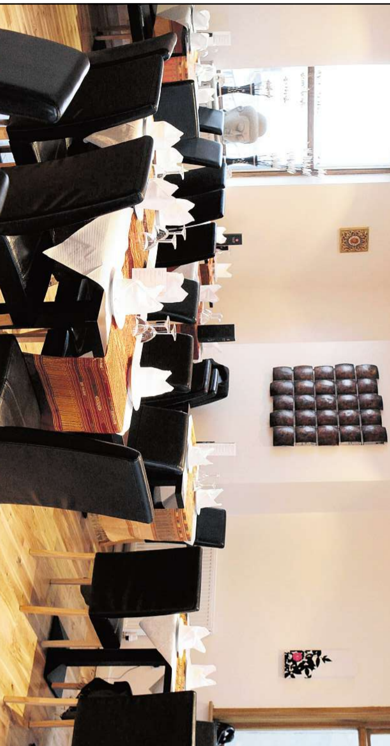
■ SMART AND SUBTLE: Pu Ja Thai restaurant in Lindley blends contemporary decoration with a touch of the Far East.

THAI food is the one cuisine that does everything for me (apart from my mum's stew!).