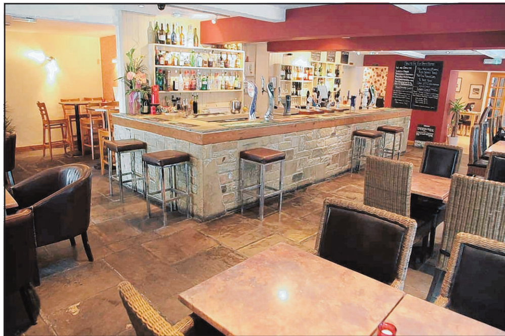
■ BISTRO: The pleasant surroundings of The Fox Bar & Bistro

Particularly popular with Fox diners is the