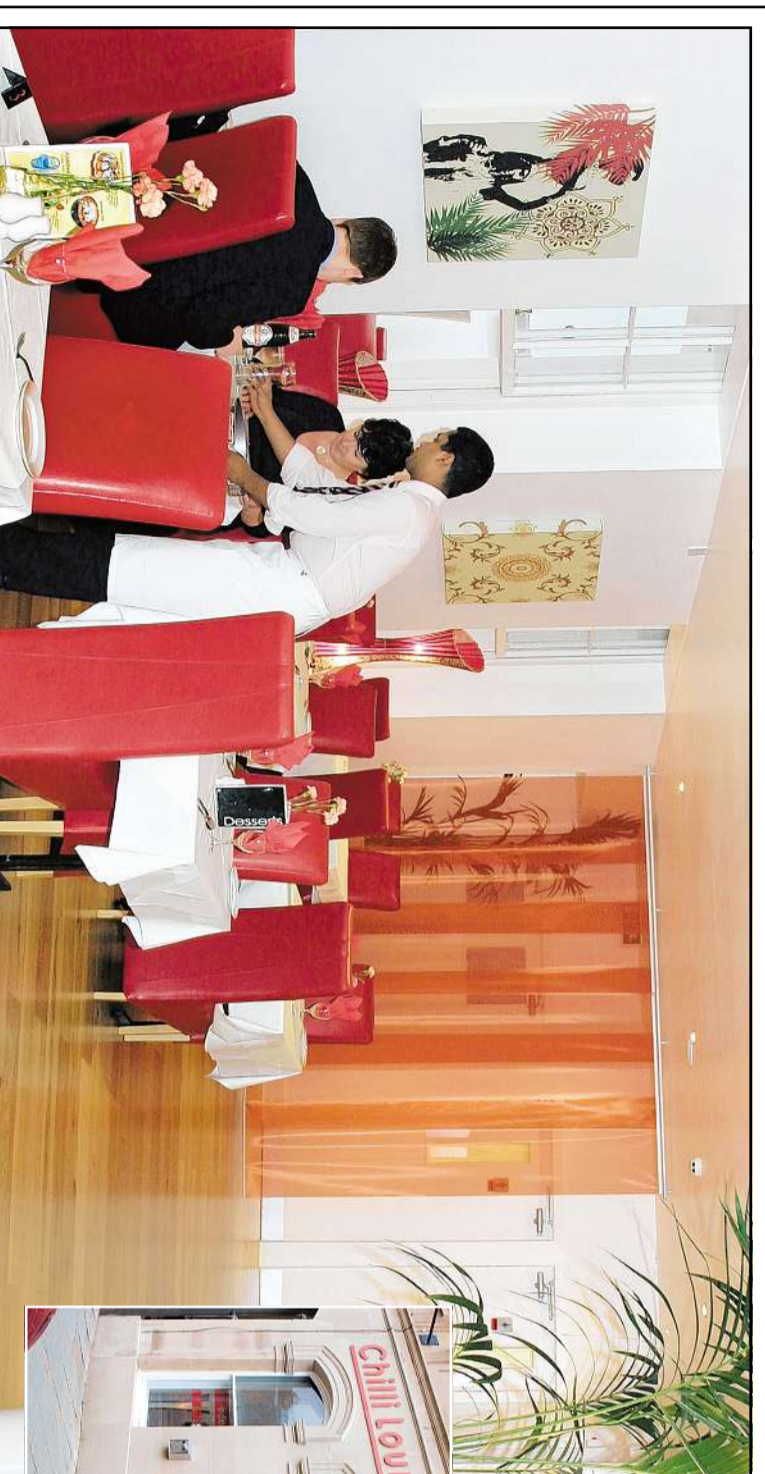
SMART SERVICE: The politeness of staff was quite striking

To see how much Indian restaurants have progressed over the last few years, you should look no further than the brand spanking new Chill Lounge in John William Street, Huddersfield.