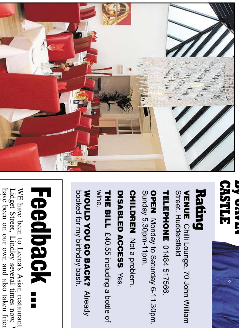
CRYSTAL CHANDELIER: The chandelier is the restaurant's centrepiece

If awards were given for interior design in the restaurant trade, they would be stacked up behind the bar here. All white walls with striking red leather seats and fabulous Indian-themed red prints on the walls, with the centrepiece, a huge chandelier in the