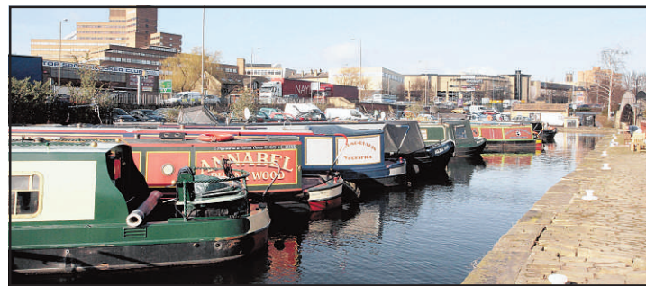
Barges moored up at Aspley Canal Basin

Originally Moldgreen was an area of common grazing as the suffix 'green' suggests and early references to the area talk about the digging of stone and feeding of geese. The prefix 'mold' may refer to the practice of extracting black earth from the area around Carr Pit.