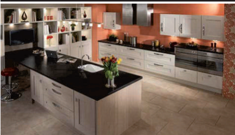
New Showroom Displays