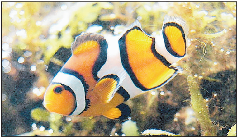
Discover fascinating creatures at Rhyl Sea Life Centre