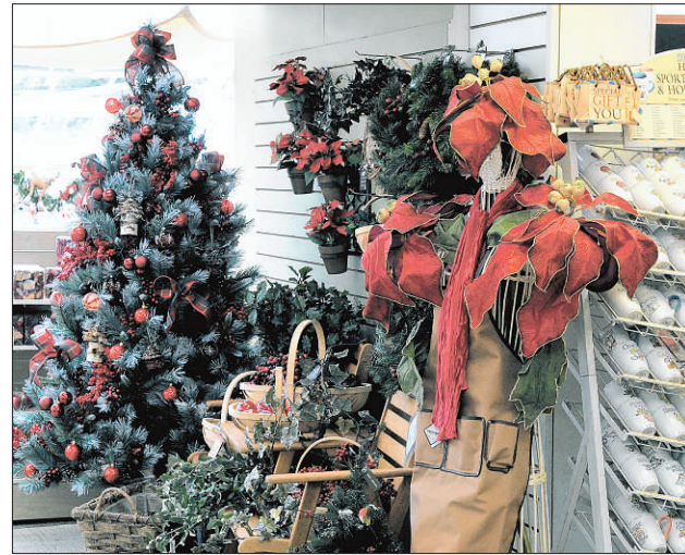
Get inspired for the festive season with a wonderful range of Christmas trees and decorations in store ZYGR071008BODNANT

Situated adjacent to the stunning Bodnant Gardens, the centre, which is open all year round, is set in the most idyllic surroundings, and has a bespoke cobbled street which houses the craft units where you will find Tina Holley Studios, Italian World