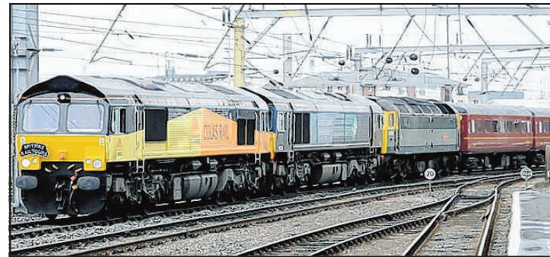
ON TRACK: Cumbrian Crusader II is one of the trains used by Spitfire.

Norwich is proud of its past and present status. Its ancient buildings and city wall remains make it the most complete medieval city in Britain.