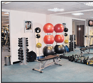
SUCCESSFUL: PT Fitness has extended its floor space.

If you're looking to get fit for summer, then PT Fitness could be the place for you. It's a friendly